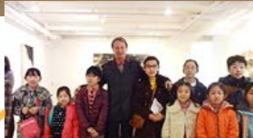
Along with Embassy of Switzerland, Design Switzerland 'Cris+Cross' Exhibition

Prepare qualifications as a cultural ambassador who will lead the world Through cultural events with invitation of government organizations, and relay lectures with global leaders