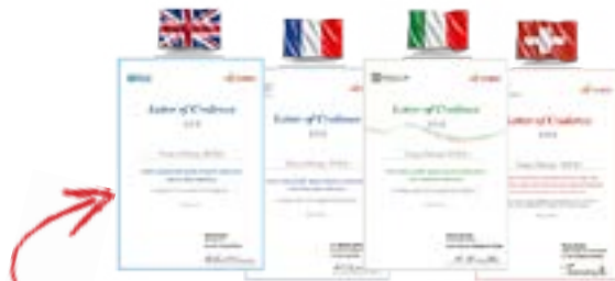
Junior Ambassador certification that is authorized and signed by government organizations