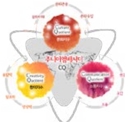
- Junior Ambassador CQ -

Become a junior ambassador by receiving appointment certificate authorized by government organizations, Be with other future global leaders side by side, Grow up to be a leader of global community who will change the future of humanity.